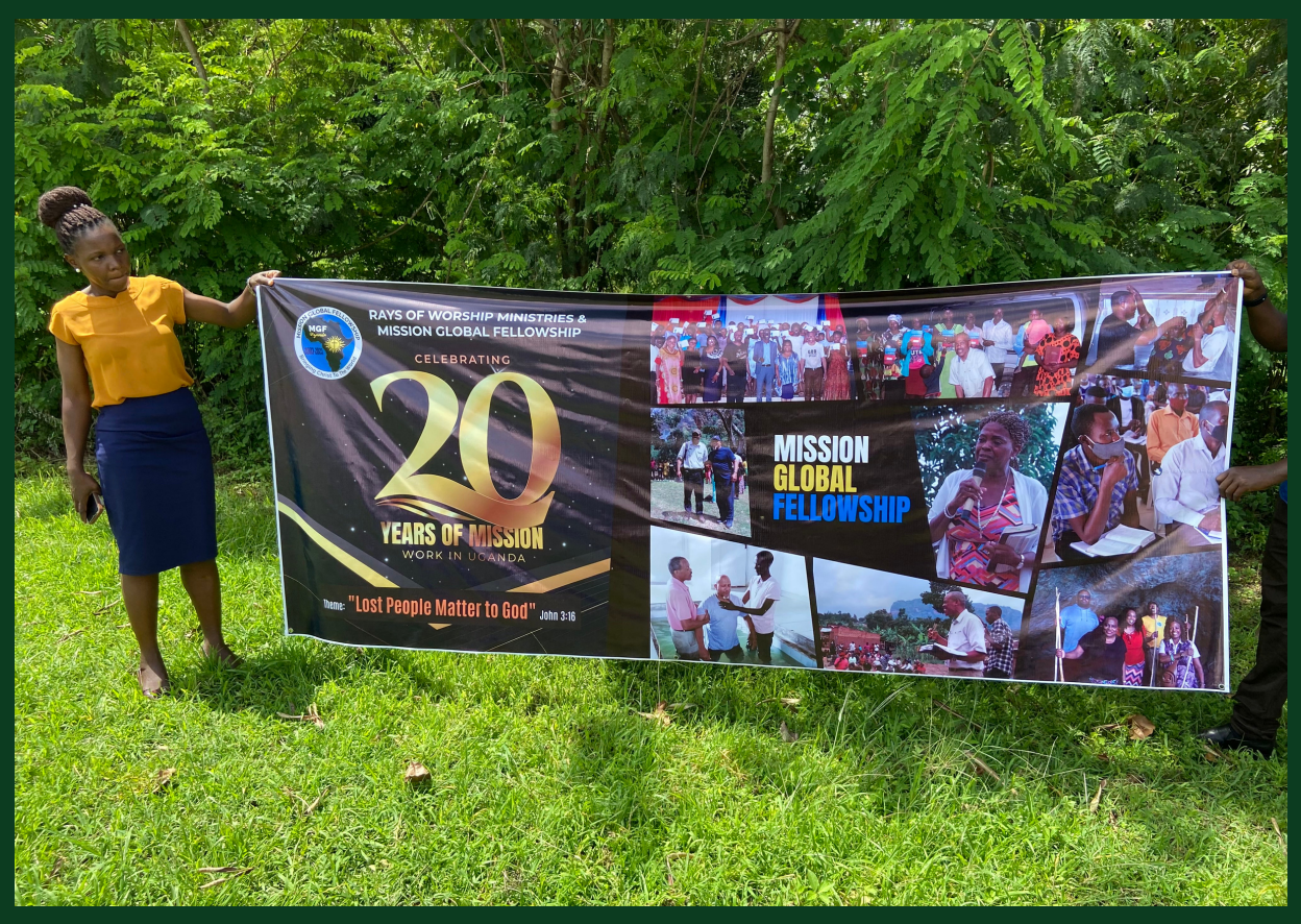
Cannot wait to tell this testimony of God's faithfulness for his Kingdom Work" (Matt. 28:19-20)