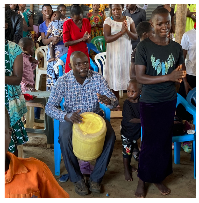
Kingdom Video Mbale Trip 2024